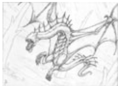
Thompson's initial sketch.