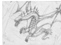
A redo of the first sketch. The main differences are in the head detail, to give it some sensory organs.